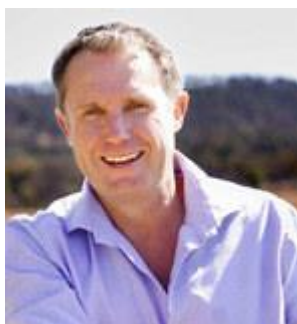
Sam Coupland - A comment from the Armidale Mayor