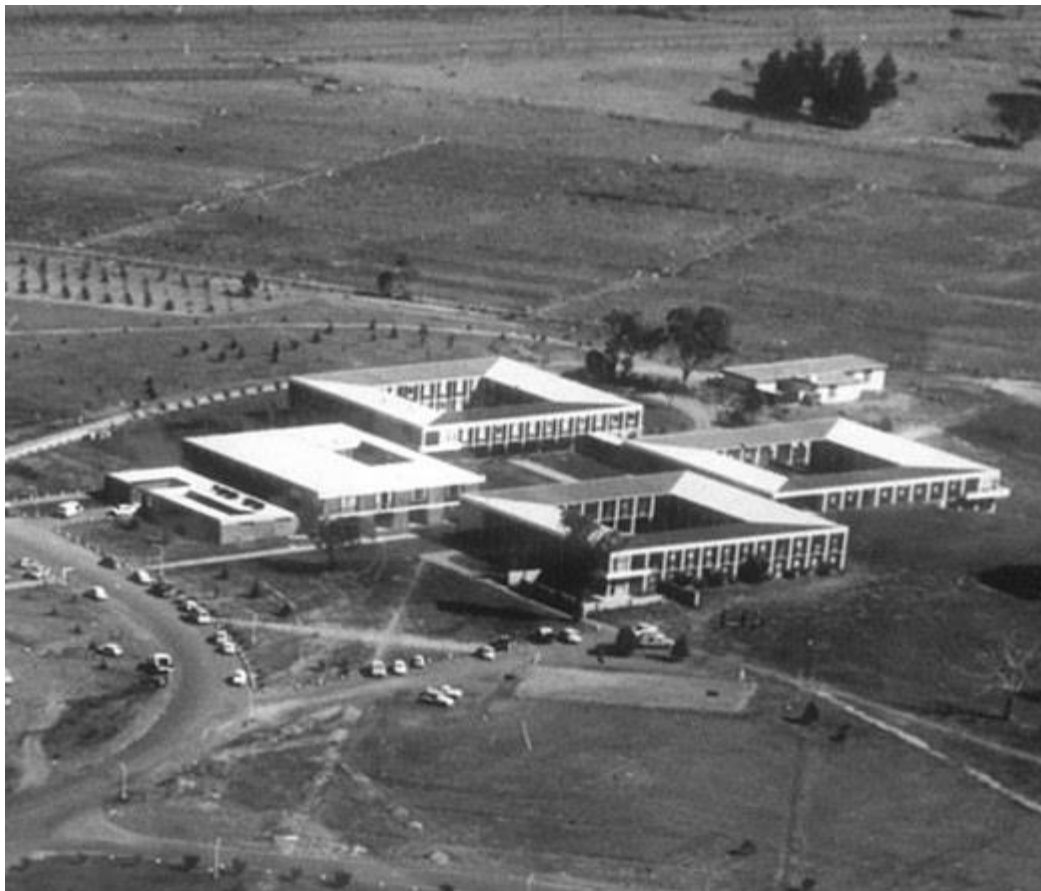
Robb College early 1960's. This photo used to sit in a frame in the Robb office.