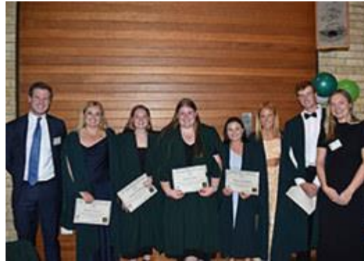
BCJ Meredith Scholarship winners (first years)