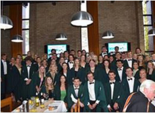
2023 Freshers cohort