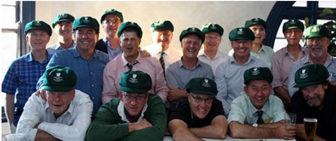
Robb 3rd XV 1979 Premiers

No overall placings as of yet due to being early in the competition.