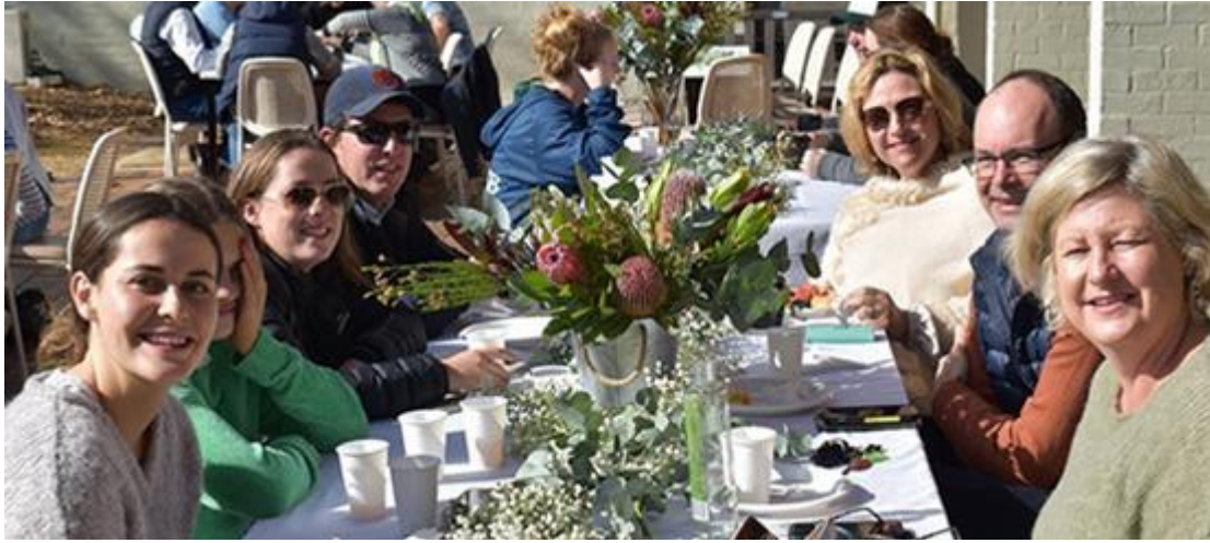
Robb College Parents' Weekend